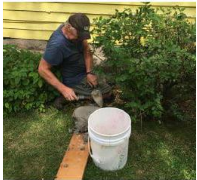
Knights of Columbus Council 4125 Tomah, WI Leave no Neighbor Behind project. Helping a widow of a deceased Brother Knight with repairs to her house.