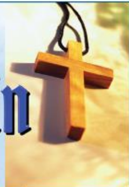
Silver Rose, from reception to pass off